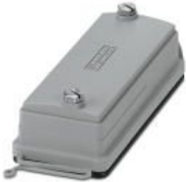
HEAVYCON ADVANCE, IP66, B16 protective cover, for panel mounting side, with screw locking, with retaining cord, diameter of retaining cord eyelet: 3 mm

Please be informed that the data shown in this PDF Document is generated from our Online Catalog. Please find the complete data in the user's documentation. Our General Terms of Use for Downloads are valid ( http://phoenixcontact.com/download )