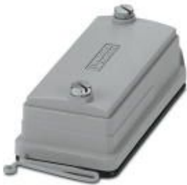
HEAVYCON ADVANCE, IP66, B10 protective cover for panel mounting side, with screw locking, with retaining cord, diameter of retaining cord eyelet: 3 mm

Please be informed that the data shown in this PDF Document is generated from our Online Catalog. Please find the complete data in the user's documentation. Our General Terms of Use for Downloads are valid ( http://phoenixcontact.com/download )