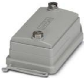
HEAVYCON ADVANCE, IP66, B6 protective cover for panel mounting side, with screw locking, with retaining cord, diameter of retaining cord eyelet: 3 mm

Please be informed that the data shown in this PDF Document is generated from our Online Catalog. Please find the complete data in the user's documentation. Our General Terms of Use for Downloads are valid ( http://phoenixcontact.com/download )