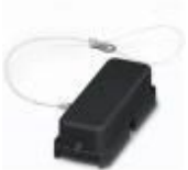
Protective cover D15, for single locking latch, protective cover material: PA, height: 20.5 mm, seal: yes

Protective covers - HC-D15-BCSFS-PRBK - 1414641