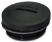
Filler plug, plastic, size: M25