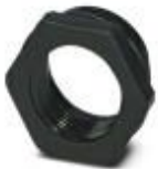
Reducing adapter, material: Polyamide fiberglass reinforced, connecting thread: M25 x 1.5, color: black, with flat gasket

Reducing adapter - REDUC-K-KV-M25/M20 BK - 1411232