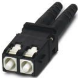
SC-RJ connector, with bend protection, for 200/230 \mu\text{m} , 50/200/230 \mu\text{m} , and 62.5/200/230 \mu\text{m} PCF fibers

Please be informed that the data shown in this PDF Document is generated from our Online Catalog. Please find the complete data in the user's documentation. Our General Terms of Use for Downloads are valid ( http://phoenixcontact.com/download )