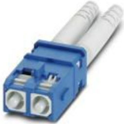
SC-RJ connector, with long bend protection, for single mode 9/125 µm, PC polishing, blue, value pack: 10 pcs

Please be informed that the data shown in this PDF Document is generated from our Online Catalog. Please find the complete data in the user's documentation. Our General Terms of Use for Downloads are valid ( http://phoenixcontact.com/download )