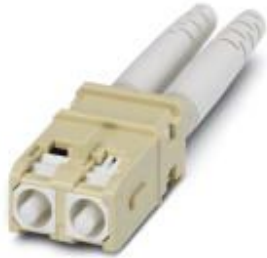
SC-RJ connector, with long bend protection, multi-mode 50/125 μm, beige, value pack: 10 pcs.

Please be informed that the data shown in this PDF Document is generated from our Online Catalog. Please find the complete data in the user's documentation. Our General Terms of Use for Downloads are valid ( http://phoenixcontact.com/download )