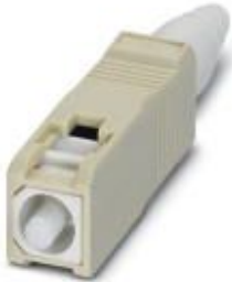
SC connector, with short bend protection (pigtail), for multi-mode 50/125 µm, beige

Please be informed that the data shown in this PDF Document is generated from our Online Catalog. Please find the complete data in the user's documentation. Our General Terms of Use for Downloads are valid ( http://phoenixcontact.com/download )