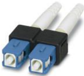
SC duplex connector, with long bend protection, for single mode 9/125 μm, PC polishing, blue

Please be informed that the data shown in this PDF Document is generated from our Online Catalog. Please find the complete data in the user's documentation. Our General Terms of Use for Downloads are valid ( http://phoenixcontact.com/download )