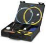
Tool set for GOF assembly

Tool set - FOC-TOOL-GOF KONF SET - 1411049