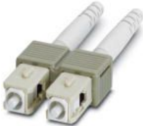
SC duplex connector, with long bend protection, for multi-mode 50/125 µm, beige

Please be informed that the data shown in this PDF Document is generated from our Online Catalog. Please find the complete data in the user's documentation. Our General Terms of Use for Downloads are valid ( http://phoenixcontact.com/download )