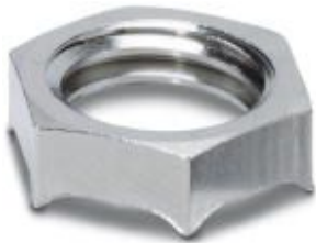
EMV nut, material: Brass, nickel-plated, for threads M20 x 1.5, color: silver

Please be informed that the data shown in this PDF Document is generated from our Online Catalog. Please find the complete data in the user's documentation. Our General Terms of Use for Downloads are valid ( http://phoenixcontact.com/download )