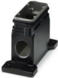
HEAVYCON B6 box mounting base, for screw locking, HPR series, with 2 x M25 gland, for increased environmental and EMC requirements

Please be informed that the data shown in this PDF Document is generated from our Online Catalog. Please find the complete data in the user's documentation. Our General Terms of Use for Downloads are valid ( http://phoenixcontact.com/download )