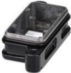
HEAVYCON B6 panel mounting base, HPR series, for screw locking, for increased environmental and EMC requirements

Please be informed that the data shown in this PDF Document is generated from our Online Catalog. Please find the complete data in the user's documentation. Our General Terms of Use for Downloads are valid ( http://phoenixcontact.com/download )