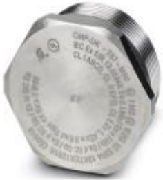
Screw plug, cable gland material: Nickel-plated brass, application: Ex, connecting thread: M63 x 1.5, color: silver

Please be informed that the data shown in this PDF Document is generated from our Online Catalog. Please find the complete data in the user's documentation. Our General Terms of Use for Downloads are valid ( http://phoenixcontact.com/download )