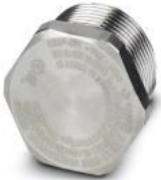
Screw plug, cable gland material: Nickel-plated brass, application: Ex, connecting thread: M32 x 1.5, color: silver

Please be informed that the data shown in this PDF Document is generated from our Online Catalog. Please find the complete data in the user's documentation. Our General Terms of Use for Downloads are valid ( http://phoenixcontact.com/download )