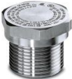
Screw plug, cable gland material: Stainless steel 316L, application: Ex, connecting thread: M25 x 1.5, color: silver

Please be informed that the data shown in this PDF Document is generated from our Online Catalog. Please find the complete data in the user's documentation. Our General Terms of Use for Downloads are valid ( http://phoenixcontact.com/download )