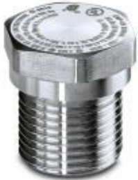
Screw plug, cable gland material: Nickel-plated brass, application: Ex, connecting thread: M25 x 1.5, color: silver

Please be informed that the data shown in this PDF Document is generated from our Online Catalog. Please find the complete data in the user's documentation. Our General Terms of Use for Downloads are valid ( http://phoenixcontact.com/download )