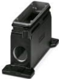
HEAVYCON B24 box mounting base, for screw locking, HPR series, with 2 x M40 gland, for increased environmental and EMC requirements

Please be informed that the data shown in this PDF Document is generated from our Online Catalog. Please find the complete data in the user's documentation. Our General Terms of Use for Downloads are valid ( http://phoenixcontact.com/download )