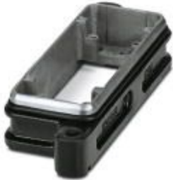
HEAVYCON B16 panel mounting base, HPR series, for screw locking, for increased environmental and EMC requirements

Please be informed that the data shown in this PDF Document is generated from our Online Catalog. Please find the complete data in the user's documentation. Our General Terms of Use for Downloads are valid ( http://phoenixcontact.com/download )