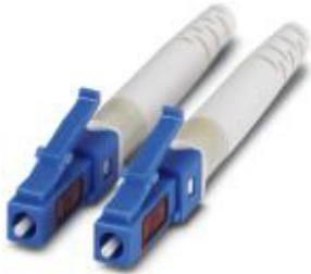
LC duplex connector, with long bend protection, for single mode 9/125 µm, PC polishing, blue

Please be informed that the data shown in this PDF Document is generated from our Online Catalog. Please find the complete data in the user's documentation. Our General Terms of Use for Downloads are valid ( http://phoenixcontact.com/download )