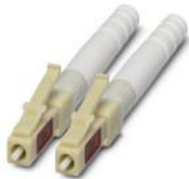
LC duplex connector, with long bend protection, for multi-mode 50/125 µm, beige

Please be informed that the data shown in this PDF Document is generated from our Online Catalog. Please find the complete data in the user's documentation. Our General Terms of Use for Downloads are valid ( http://phoenixcontact.com/download )