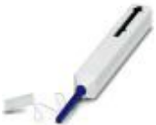
Ferrule cleaner, 1.25 mm, for LC, approx. 500 cleaning cycles

FO accessories - FOC-TOOL-FERRULECLEANER-1.25 - 1407032