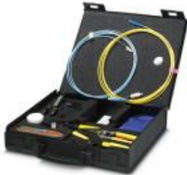
Tool set for GOF assembly

Please be informed that the data shown in this PDF Document is generated from our Online Catalog. Please find the complete data in the user's documentation. Our General Terms of Use for Downloads are valid ( http://phoenixcontact.com/download )