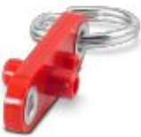
Red light source adapter

FO accessories - FOC-TOOL-LIGHTSOURCE-ADAPTER - 1414097