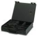
Replacement case, empty

FO accessories - FOC-TOOL-CASE-EMPTY - 1414095