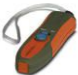
Red light source (650 nm)

FO accessories - FOC-TOOL-LIGHTSOURCE-650 - 1414098