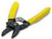
Fiber stripper for AWG 22 - 10 / (0.6 ... 2.6 mm)

FO accessories - FOC-TOOL-STRIPPING-FA-2 - 1414100