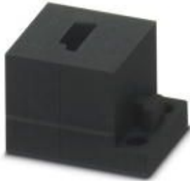
Small, slotted cable sleeves suitable for one AS-i cable, material: NBR, version: left

Please be informed that the data shown in this PDF Document is generated from our Online Catalog. Please find the complete data in the user's documentation. Our General Terms of Use for Downloads are valid ( http://phoenixcontact.com/download )