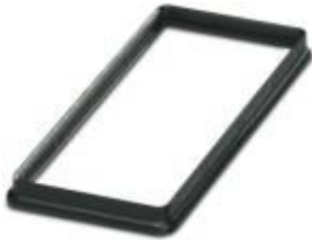
Profile gasket for sleeve housing type B16.....EEE

Please be informed that the data shown in this PDF Document is generated from our Online Catalog. Please find the complete data in the user's documentation. Our General Terms of Use for Downloads are valid ( http://phoenixcontact.com/download )