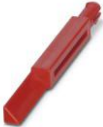
Coding profile for Q12 series

Please be informed that the data shown in this PDF Document is generated from our Online Catalog. Please find the complete data in the user's documentation. Our General Terms of Use for Downloads are valid ( http://phoenixcontact.com/download )