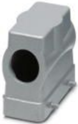
HEAVYCON B16 sleeve housing, for double locking latch, height: 76 mm, with 1 x M32 thread, lateral cable outlet

Please be informed that the data shown in this PDF Document is generated from our Online Catalog. Please find the complete data in the user's documentation. Our General Terms of Use for Downloads are valid ( http://phoenixcontact.com/download )