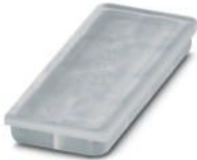
Coated protective cover for the housing on the motor side

Please be informed that the data shown in this PDF Document is generated from our Online Catalog. Please find the complete data in the user's documentation. Our General Terms of Use for Downloads are valid ( http://phoenixcontact.com/download )