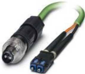
Assembled FO cable, round cable, 980/1000 µm POF fiber, M12 fiber optic connector to SC-RJ/IP20

Please be informed that the data shown in this PDF Document is generated from our Online Catalog. Please find the complete data in the user's documentation. Our General Terms of Use for Downloads are valid ( http://phoenixcontact.com/download )