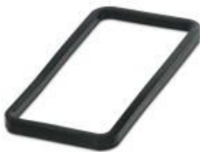
Profile gasket for HEAVYCON EVO supporting base element type B16

Please be informed that the data shown in this PDF Document is generated from our Online Catalog. Please find the complete data in the user's documentation. Our General Terms of Use for Downloads are valid ( http://phoenixcontact.com/download )