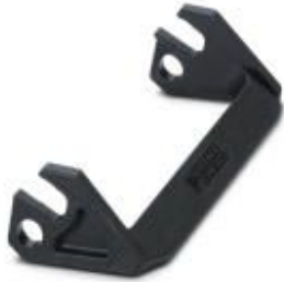
Replacement single locking latch for HEAVYCON EVO housing type B24, PA

Please be informed that the data shown in this PDF Document is generated from our Online Catalog. Please find the complete data in the user's documentation. Our General Terms of Use for Downloads are valid ( http://phoenixcontact.com/download )