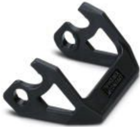
Replacement single locking latch for HEAVYCON EVO housing type B6, PA

Please be informed that the data shown in this PDF Document is generated from our Online Catalog. Please find the complete data in the user's documentation. Our General Terms of Use for Downloads are valid ( http://phoenixcontact.com/download )