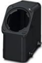
HEAVYCON EVO sleeve housing, plastic, with bayonet flange for EVO screw connection, B16, for double locking latch, height: 78 mm, without EVO screw connection

Please be informed that the data shown in this PDF Document is generated from our Online Catalog. Please find the complete data in the user's documentation. Our General Terms of Use for Downloads are valid ( http://phoenixcontact.com/download )