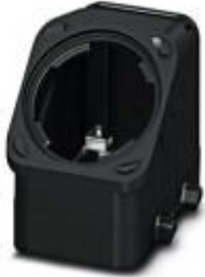
HEAVYCON EVO sleeve housing, plastic, with bayonet flange for EVO screw connection, B10, for double locking latch, height: 60.5 mm, without EVO screw connection

Please be informed that the data shown in this PDF Document is generated from our Online Catalog. Please find the complete data in the user's documentation. Our General Terms of Use for Downloads are valid ( http://phoenixcontact.com/download )