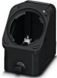
HEAVYCON EVO sleeve housing, plastic, with bayonet flange for EVO screw connection, B10, for single locking latch, height: 60.5 mm, without EVO screw connection

Please be informed that the data shown in this PDF Document is generated from our Online Catalog. Please find the complete data in the user's documentation. Our General Terms of Use for Downloads are valid ( http://phoenixcontact.com/download )