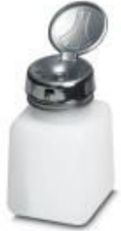
Solvent dispenser, 100 ml, lockable pump dispenser

Please be informed that the data shown in this PDF Document is generated from our Online Catalog. Please find the complete data in the user's documentation. Our General Terms of Use for Downloads are valid ( http://phoenixcontact.com/download )