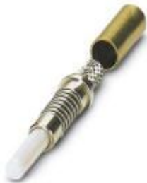
Replacement ferrule set (10 pcs.) for M12 PCF fiber optic connector (Order No. 1416619)

Please be informed that the data shown in this PDF Document is generated from our Online Catalog. Please find the complete data in the user's documentation. Our General Terms of Use for Downloads are valid ( http://phoenixcontact.com/download )