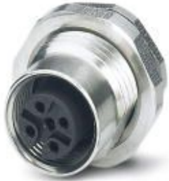
Flush-type connector, 4-position, Socket, straight, M12, A-coded, Rear mounting, Pg9, Solder pins

Please be informed that the data shown in this PDF Document is generated from our Online Catalog. Please find the complete data in the user's documentation. Our General Terms of Use for Downloads are valid ( http://phoenixcontact.com/download )