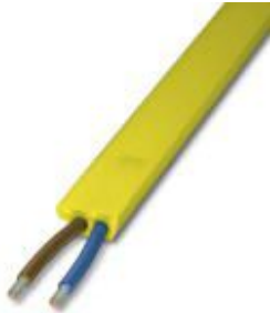
AS-Interface TPE flat conductor with UL in yellow, 2 x 1.5 mm 2 , 100 m ring

Please be informed that the data shown in this PDF Document is generated from our Online Catalog. Please find the complete data in the user's documentation. Our General Terms of Use for Downloads are valid ( http://phoenixcontact.com/download )