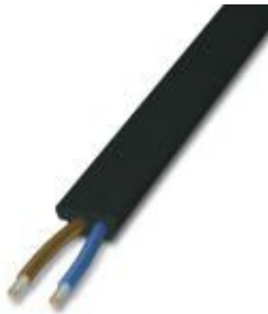
AS-Interface PVC flat conductor with UL in black, for additional power supply, 2 x 1.5 mm 2 , 100 m ring

Please be informed that the data shown in this PDF Document is generated from our Online Catalog. Please find the complete data in the user's documentation. Our General Terms of Use for Downloads are valid ( http://phoenixcontact.com/download )