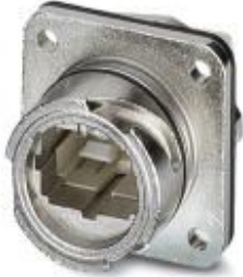
SC-RJ panel mounting frame, IP67, for bayonet locking, metal, with coupling for multi-mode, POF, SC-RJ to SC-RJ, for round mounting cutout, with seal, without mounting screws

Please be informed that the data shown in this PDF Document is generated from our Online Catalog. Please find the complete data in the user's documentation. Our General Terms of Use for Downloads are valid ( http://phoenixcontact.com/download )