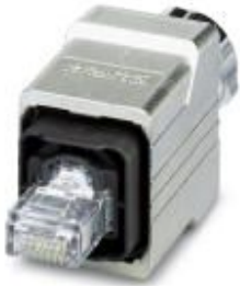
RJ45 connector, number of positions: 8

Please be informed that the data shown in this PDF Document is generated from our Online Catalog. Please find the complete data in the user's documentation. Our General Terms of Use for Downloads are valid ( http://phoenixcontact.com/download )