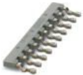
Insertion bridge, 10-pos., for strip terminal block, BK 4

Insertion bridge - EB 10- BK 4 - 0801131