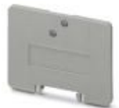
Partition plate, length: 42.5 mm, width: 2.5 mm, height: 30.5 mm, color: gray