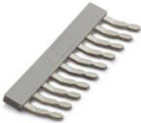
Insertion bridge, pitch: 5.2 mm, number of positions: 10, color: gray

Please be informed that the data shown in this PDF Document is generated from our Online Catalog. Please find the complete data in the user's documentation. Our General Terms of Use for Downloads are valid ( http://phoenixcontact.com/download )