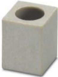
Bridge bar isolator, color: gray

Please be informed that the data shown in this PDF Document is generated from our Online Catalog. Please find the complete data in the user's documentation. Our General Terms of Use for Downloads are valid ( http://phoenixcontact.com/download )