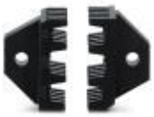
Replacement die for CRIMPFOX 16R TWIN

Replacement die - CRIMPFOX 16R TWIN/DIE - 1212846