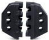
Spare die for CRIMPFOX-SC 6

Replacement die - CRIMPFOX-SC 6/DIE - 1212051