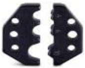
Spare die for CRIMPFOX-RC 10

Replacement die - CRIMPFOX-RC 10/DIE - 1212062