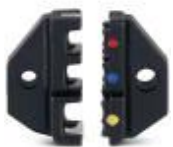
Spare die for CRIMPFOX-RCI 6

Replacement die - CRIMPFOX-RCI 6/DIE - 1212058