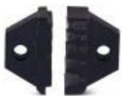
Spare die for CRIMPFOX 6

Replacement die - CRIMPFOX 6/DIE - 1212035