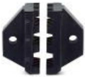
Spare die for CRIMPFOX 25R

Replacement die - CRIMPFOX 25R/DIE - 1212040